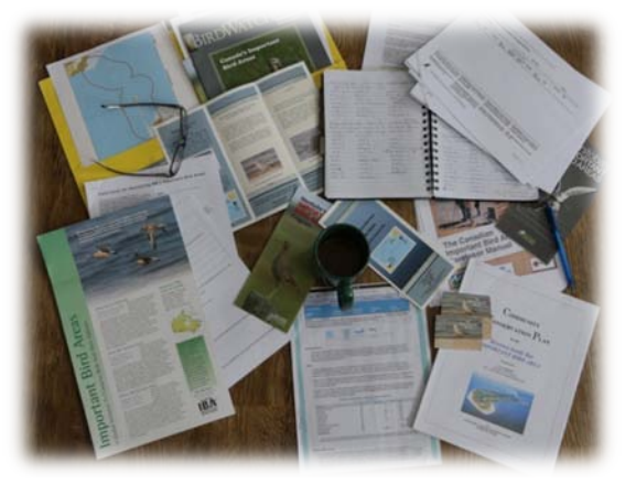
Caretaker materials

Studies Canada manages the eBird Canada portal, where all bird data collected should be submitted. A special <u>IBA Canada Protocol</u> can be used within eBird to record observations in specific circumstances. Use of eBird is described in more detail on the IBA Canada website and in a tutorial on the IBA Canada YouTube channel (see below).