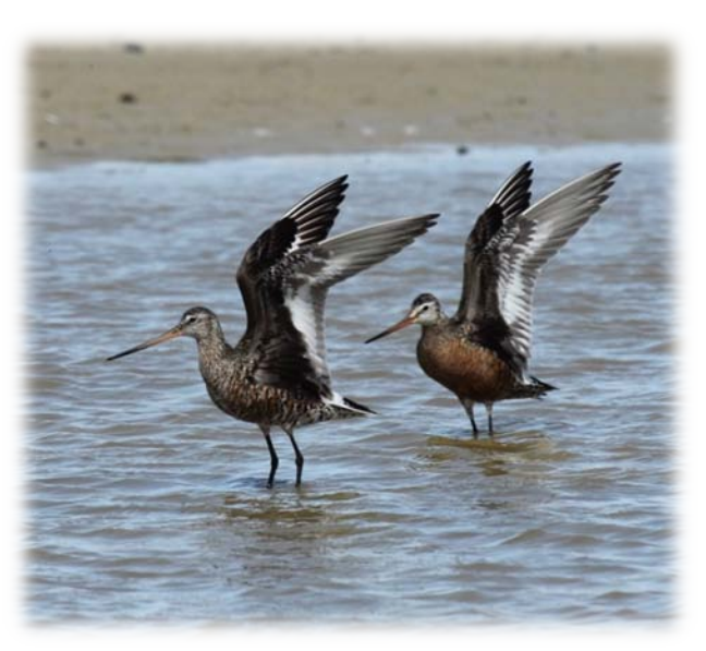
Hudsonian Godwits

The Caretaker concept is now a major pillar of Canada's IBA Program. It took root in 2007, when BC Nature initiated a provincewide IBA Caretaker Network based on similar networks in Europe. The idea was to engage volunteers with an interest in birds or the conservation of a particular area to become 'caretakers' for the province's IBAs. The job description was simple – visit the site when the 'trigger' bird population(s) are present, and report back on habitat conditions, bird population observations, any signs of threats to the birds or habitat, and information on any conservation efforts taking place. This information would be used by regional and national IBA staff to