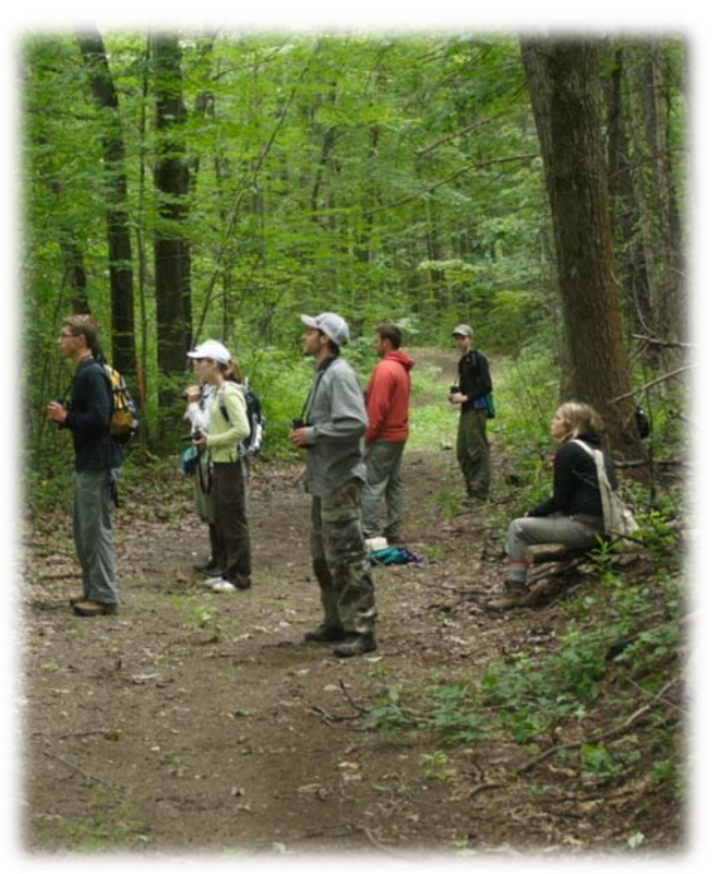
Norfolk Forest Complex

IBA Caretakers are individuals or groups of people who voluntarily commit to caring for one or more IBAs in Canada. This commitment is made typically as a formal agreement between you (the Caretaker or Caretaker Group), and the Regional Partner. In general, Caretakers keep track of and report on changes to bird populations and habitats (including potential threats) within IBAs. Information gathered by Caretakers helps Regional and National IBA Canada Partners engage in effective bird conservation efforts by keeping information up-to-date and responding to threats to habitats and species. Caretakers may also choose to engage in other important conservation activities such as stewardship, outreach, site rehabilitation, conservation planning and helping to assess broader site biodiversity. Caretakers may be members of a nature club/conservation organization, be