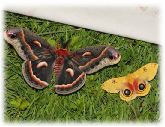
Cecropia and Io moths © Mike Burrell

IBAs are important sites for birds and for biodiversity in general. The more we know about these sites the better we can ensure they continue to provide healthy ecosystems supporting birds and other wildlife. Conducting monitoring programs for other groups of animals and plants is strongly encouraged. Talk to your Regional Coordinator about opportunities to survey plants, butterflies, reptiles and amphibians, or other groups of organisms. Some examples of protocols and projects are eButterfly, provincial butterfly atlases, bioblitzes, and reptile and amphibian atlases.