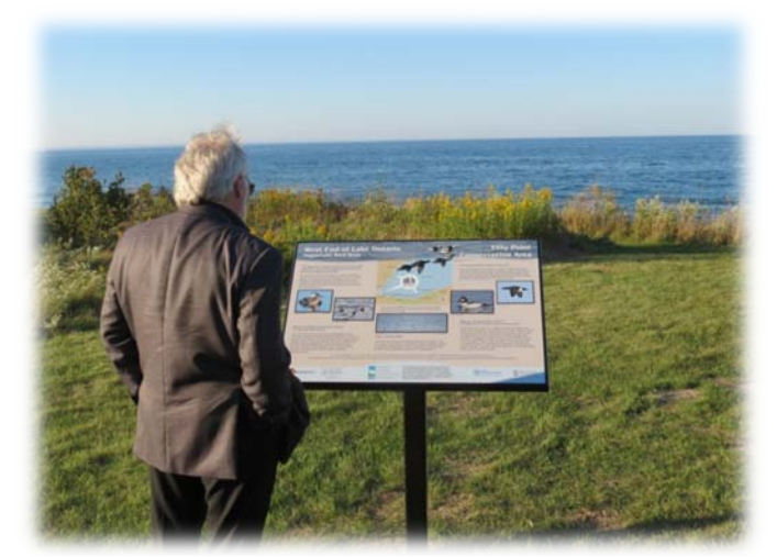
West End of Lake Ontario

habitat; installing signage or information panels; and managing the movement of visitors in the IBA to minimize negative effects and maximize positive experiences. Regional IBA Coordinators are on hand to assist by providing information and materials where possible, or by helping to identify funding sources for such activities. Examples of stewardship activities that Caretakers have done in the past include protection of sensitive nesting sites, invasive species removal, beach cleanups, tree planting, trail clearing, and nest box installation and monitoring.