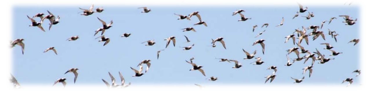
Black-bellied Plovers

When a potential conservation threat arises in an IBA, we encourage you to inform your Regional IBA Coordinator and/or National Partner to discuss actions that could be undertaken. As a Caretaker, you provide a very important local perspective, and possess local knowledge that is critical to understanding an issue. Regional and National Partners are available to help and can provide advice on an appropriate course of action, or provide contact information for government agencies that may have a regulatory role. Some examples of advocacy activities that Caretakers have taken part in include participating in public hearings about development and advocating for inclusion of IBAs and bird conservation in general to local government. In