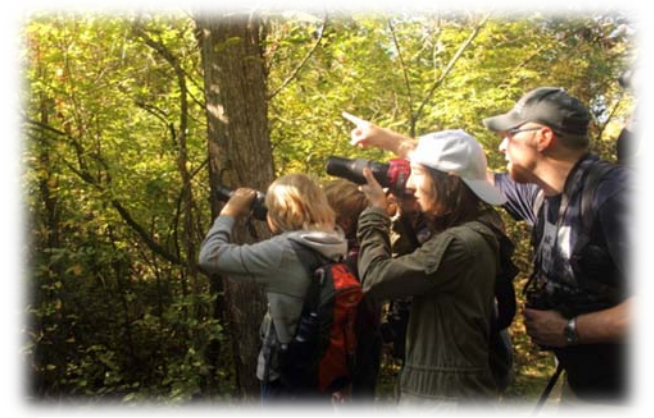
Point Pelee

or the Caretaker Resources page of the IBA Canada website. Some outreach activities currently being conducted by Caretakers include leading guided tours and field trips; building wildlife viewing infrastructure; running summer nature camps for children; including the IBA in regional ecotourism guides; starting a blog, Facebook page or website about the IBA; organizing festivals and special celebratory events; participating in meetings, workshops and local events; and engaging local decision-makers by