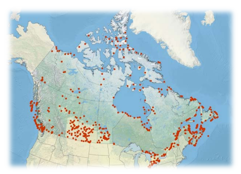
IBAs in Canada

Suggested citation: Bird Studies Canada and Nature Canada. 2015. IBA Canada Caretaker Manual. http://www.ibacanada.org/care_resources.jsp