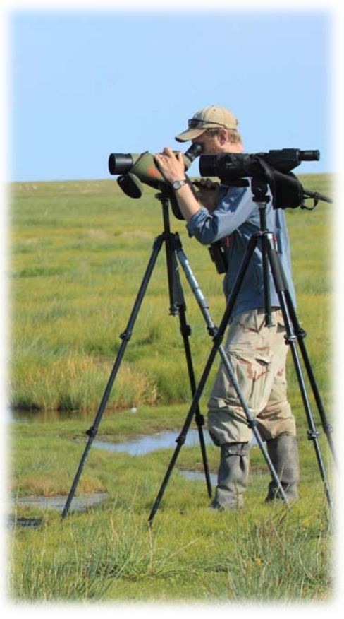
Albany River Estuary

At many IBAs, some form of bird monitoring is already taking place through Bird Studies Canada's <u>citizen</u> <u>science programs</u> or other local programs. The IBA Program seeks to build on these valuable efforts, and not duplicate them. However, since such monitoring is most likely being done incidental to IBA objectives (i.e., by surveys that do not cover the IBA adequately and/or are mistimed in relation to the presence of IBA trigger bird species), it is almost certain that additional, targeted bird monitoring will be required. The site summary (on the IBA Canada website) for any given IBA indicates the state and currency of the existing bird data